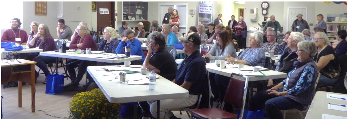
Some of the attendees.