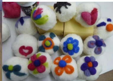
Lorea Tomsin – Needle felting decorations on dryer balls.