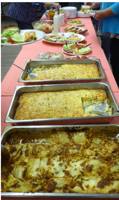
Saturday Lunch Yummy!