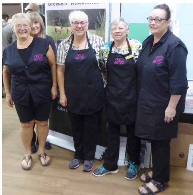
Armstrong Ladies Club catered our event. They are a group of volunteers that donate the profit to different causes with their focus on children with medical needs, i.e. transportation to BC Children's Hospital or equipment.