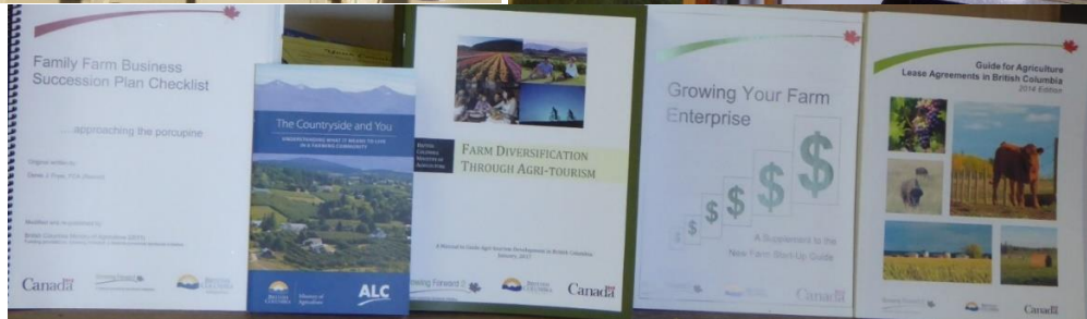
Some of the handouts available.